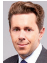
Harald Mahrer Austrian Federal Minister of Science, Research and Economy