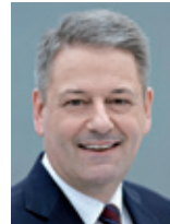
Andrä Rupprechter Federal Minister of Agriculture, Forestry, Environment and Water Management