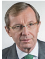
Wilfried Haslauer Governor of Salzburg