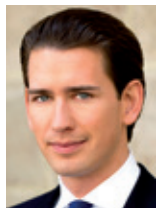
Sebastian Kurz Austrian Federal Minister for Europe, Integration and Foreign Affairs