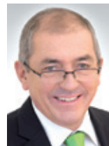
Heinz Schaden Mayor of the City of Salzburg