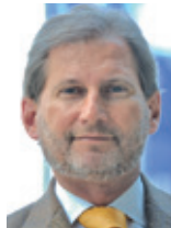
Johannes Hahn EU Commissioner for European Neighbourhood Policy & Enlargement Negotiations