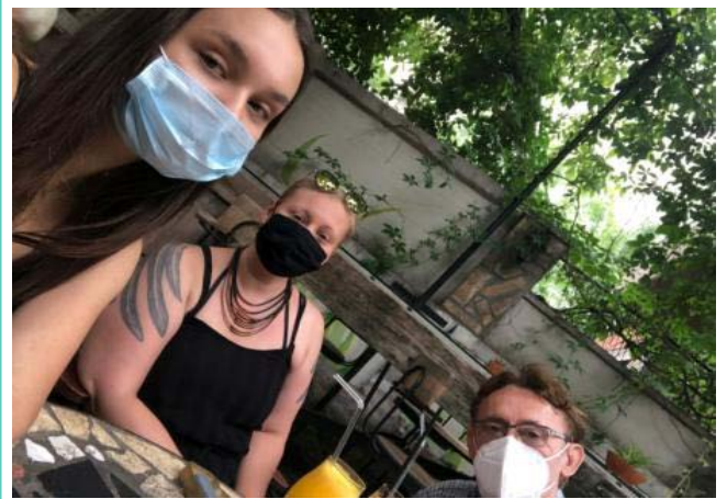
Figure 1: No close contact! (Photo S Marinković; Permission by S Marinković).

This section is mainly related to vaccines, which are the crucial